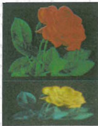
An image showing the high resolution of Validus' inkjet-printed liquid crystal images and the unambiguous multi-colour-shift